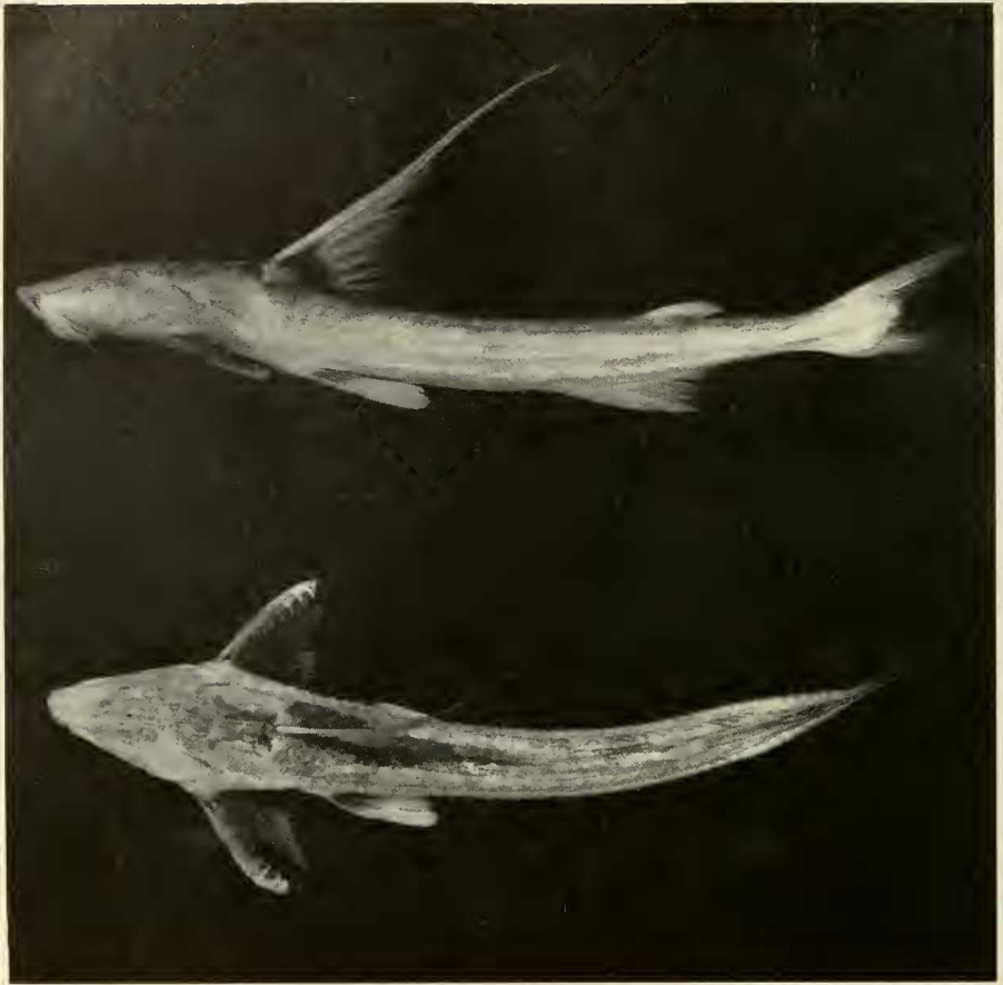
FIGURE 3. Leptodoras juruensis : 125.8 mm. standard length, ANSP 112321.

pattern (Günther 1868: 230) and IUM 15878 (Eigenmann 1925: 358) shows no trace of one. This color difference, coupled with the differences listed above between the elongate L. acipenserinus and L. myersi , plus numerous proportional differences that will be outlined in a subsequent paper, indicate how different are the two species. Leptodoras myersi has elongate, pale, raised ridges on the head, L. acipenserinus has pale low papillae, while L. linnelli has nothing of the sort.